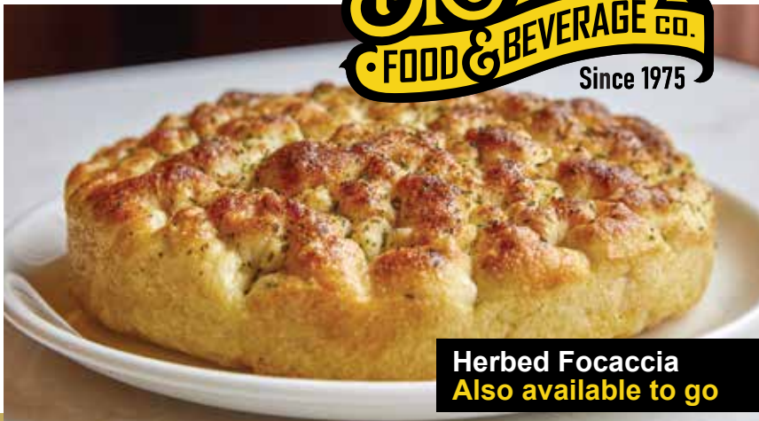
Herbed Focaccia Also available to go

The OLD BROADWAY FOOD & BEVERAGE CO. Since 1975