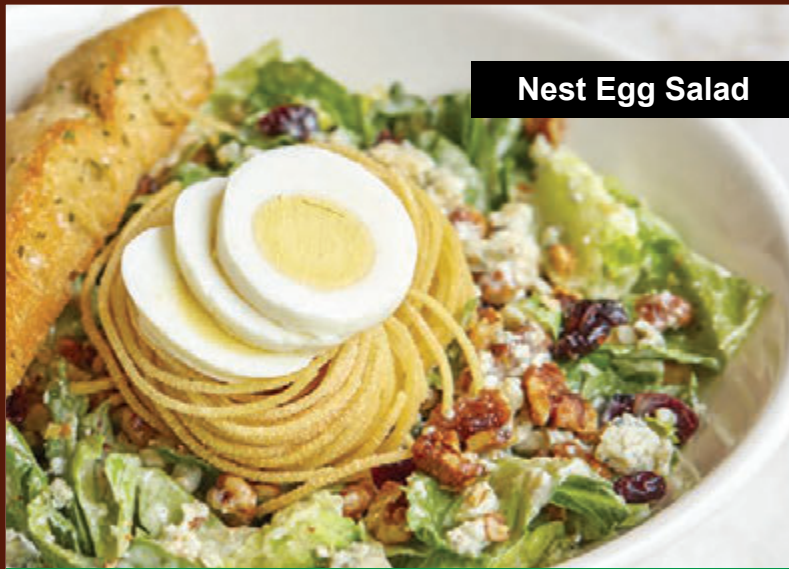
Nest Egg Salad