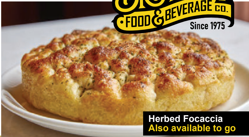
Herbed Focaccia Also available to go

The OLD BROADWAY FOOD & BEVERAGE CO. Since 1975